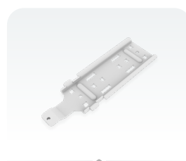
Outdoor case bracket