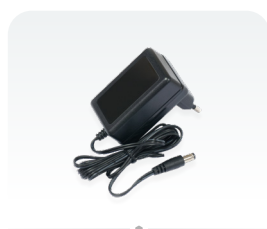
24 V 0.8 A power adapter