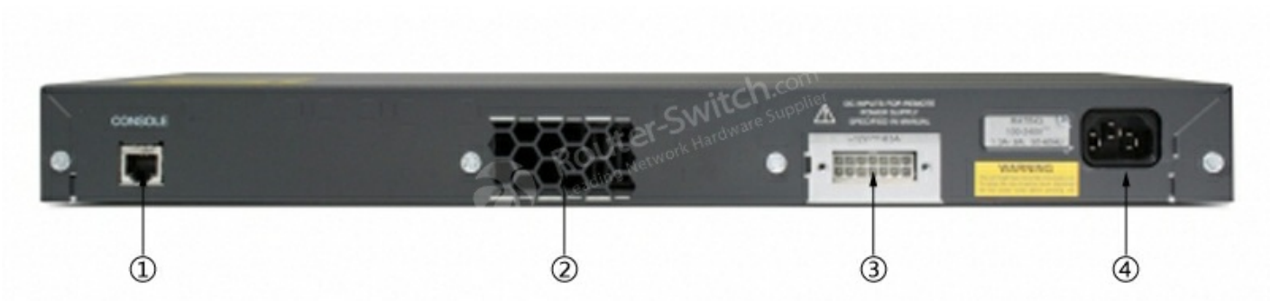
Figure 3 shows the back panel.

·Dual-purpose ports support SFP or 1000BASE-T uplink port.