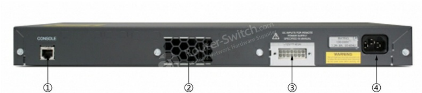
Figure 3 shows the back panel.

·Dual-purpose ports support SFP or 1000BASE-T uplink port.